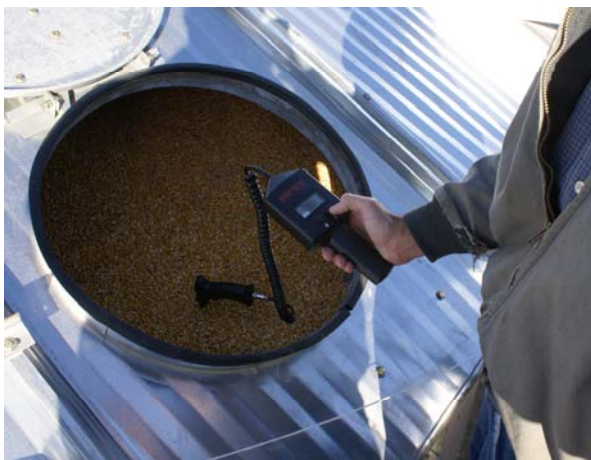
Moisture temperature checking

I have provided a slide show of the stored grain field day held earlier this month. You may find the slide show at the following URL: http://eppserver.ag.utk.edu/Extension/RPatrick/Patrick-stored-grain.htm