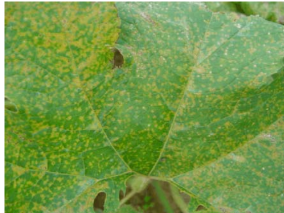
Early symptoms of downy mildew on pumpkin leaf.

If you see yellow to lime green spots on the leaves (see photo), please let me know, scbost@utk.edu . (Caution: Powdery mildew can also cause yellow spots, but can be distinguished by the presence of white spores on the undersurface of the spot.) We are participating in a project to monitor the occurrence of downy mildew in the eastern U.S. We have sentinel plots at three of the REC's, but we need reports from the field. To see the current map of the disease, see http://www.ces.ncsu.edu/depts/pp/cucurbit/images/dm080827_map.png