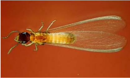
Winged Reticulitermes hageni , the light southern subterranean termite.

This time of year the light southern subterranean termite, Reticulitermes hageni , is more likely to be swarming than the other two native termite species. R. hageni is honey brown, pale brown or reddish brown which is lighter than the other two native species. It is also smaller, ranging from 7 to 8 mm from tip of the head to the wing tip. If termites are found, see PB1344, Subterranean Termite Control ,