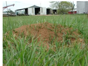
Fire ant mound.

Rain will also allow fire ants and other ants to rebuild their mounds, thus making the mounds more visible. In fact, I read that fire ant mounds appearing after this last rain caused athletic fields to be closed in Athens, TN ( http://www.wate.com/global/story.asp?s=8915645 ). Remember, most of your questions and answers pertaining to fire ants can be found at http://www.extension.org/fire+ants . Many of the fire ant products registered in Tennessee and other information on fire ants can be found on our UT fire ant web site at http://fireants.utk.edu/ .